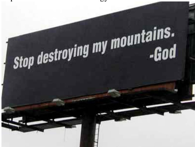
Anti-mountaintop removal billboard in West Virginia

http://www.nevadacleanenergy.com/coal:-a-bad-bet/